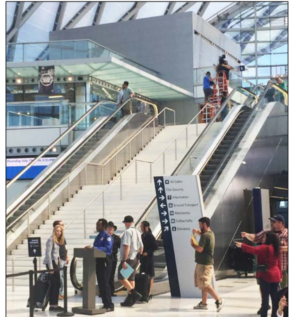
"Ray Donovan" filming: July 2016